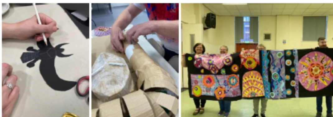
Amazing artwork created at our Middlesbrough groups that link to each venue.

Our two Middlesbrough groups are creating some amazing artwork linked to the venues they meet in. The Dorman Museum group is creating an Egyptian Sarcophagus that will become part of their current Ancient Egyptians: secrets of the afterlife exhibition. The group meeting at the International Centre have created the first of a series of giant wall-hangings that will decorate this community-based centre. Anyone is welcome to come along to either session and join the fun! The sessions at the International Centre are supported by Borderlands creative growth programme, the sessions at the Dorman Museum are supported by Creative Health. They are both 6-month pilot projects that we are still developing, so we welcome any referrals into these groups, details of when they meet below.